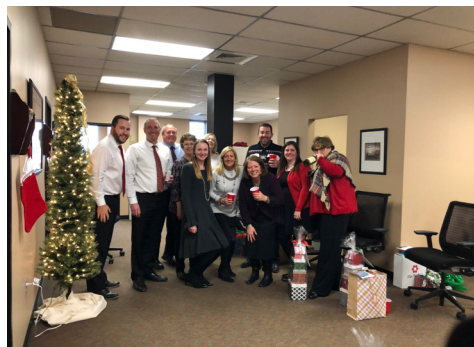
Our agency's annual gift exchange