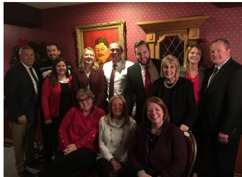
The annual Christmas party at Treasure Island