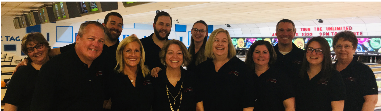
We all enjoyed a fun outing of bowling and pizza at Poelking Lanes Woodman.