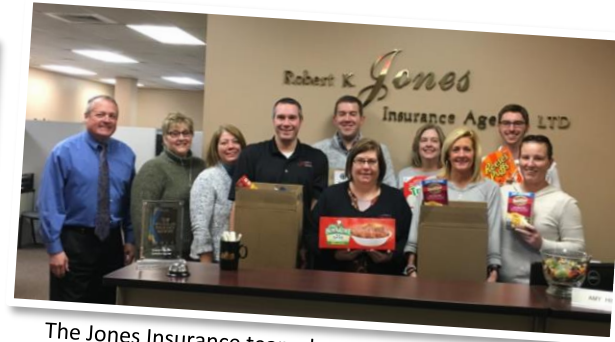
The Jones Insurance team donating food items for the holidays with PUROCLEAN OF DAYTON.