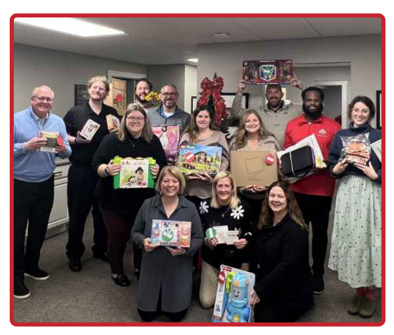
We participated in the Giving Tree for Choices (Children Have Options In Caring Environments) again this year. We were able to make a difference in a child's Christmas.